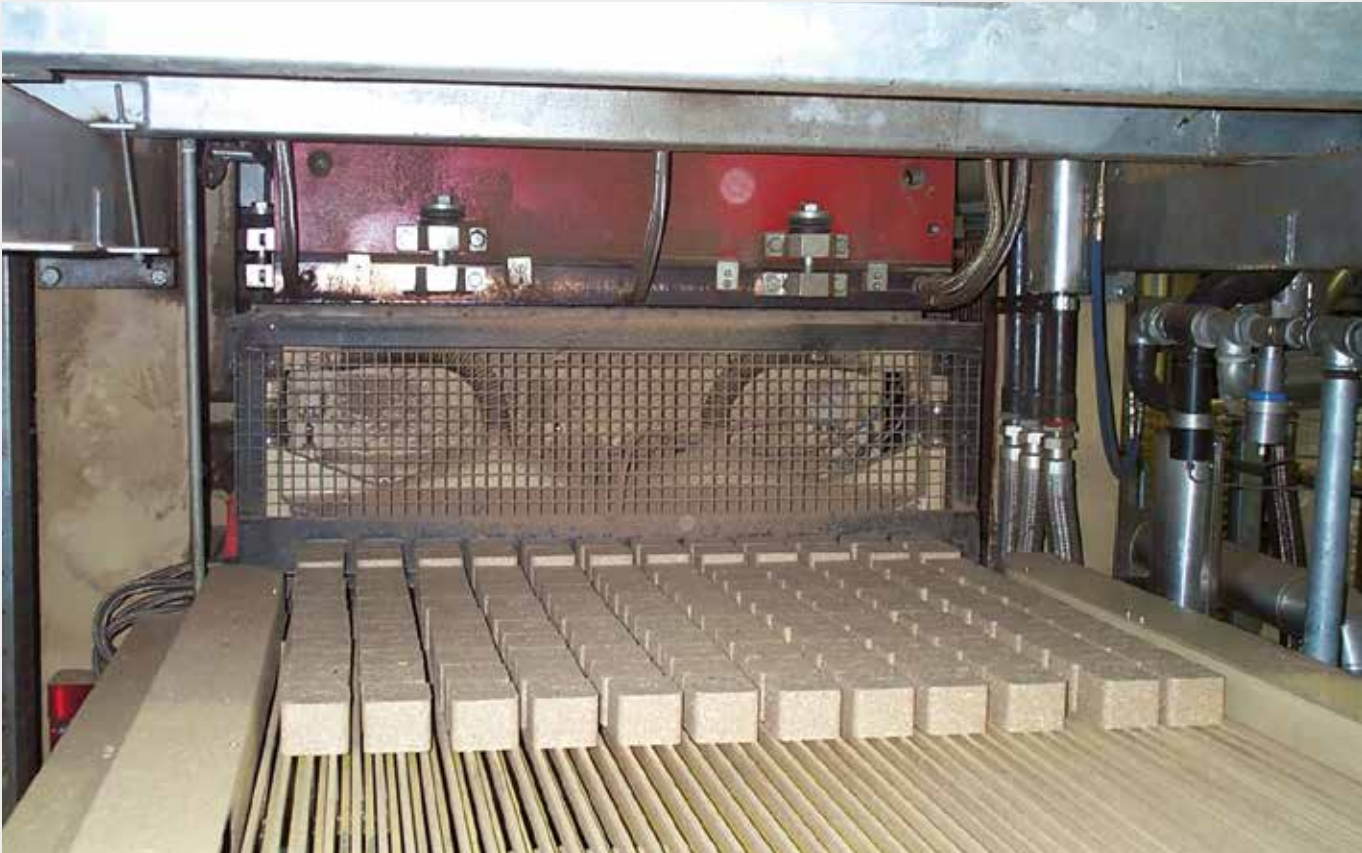
AUTOMATIC PACKAGING SYSTEM