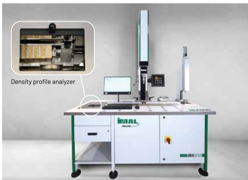
Density profile analyzer

TO CARRY OUT LABORATORY TESTS FOR BOARD QUALITY CONTROL